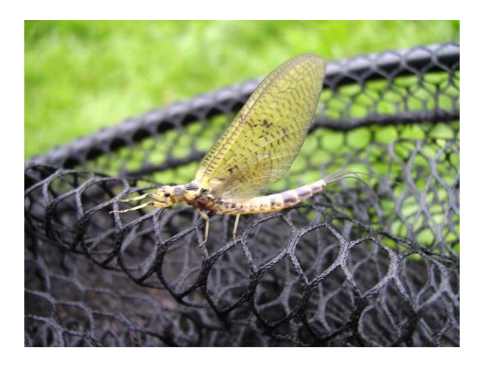
Figure 1: Ephemera danica

Mayflies are the fascinating group of short-lived winged insects that comprise the Order Ephemeroptera. There are more than 2000 different species of mayfly in the world and Britain has 51 recorded species. All mayfly nymphs live in freshwater habitats (there are no marine species) and they have colonised both flowing water (rivers and streams) and still water (ponds, lakes and reservoirs). Each species has its own characteristic time(s) of year that they tend to emerge as adult flies. One of the largest species in Britain is Ephemera danica (Figure 1) and it is commonly referred to here as "The Mayfly". The reason it is called the Mayfly is because its peak emergence is when the Mayflower (i.e. the Hawthorn) begins to bloom in late May/early June. Interestingly, the use of the term 'Mayfly' for all the Ephemeroptera only became popular in the late 1880s. Before that they had various names including Ephemerons but, more commonly, "Dayflies".