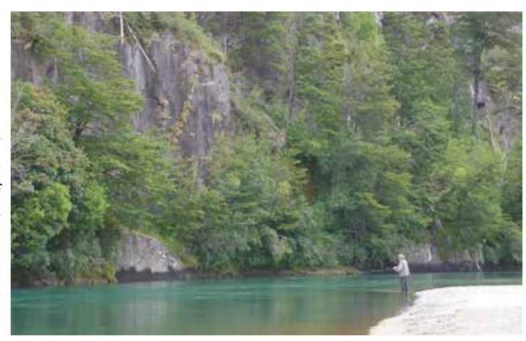
Trip No. 904 Trout Fishing in Northern Patagonia, Argentina

A trip to the beautiful Futa Lodge in Chile for 2 guests for four nights and three days' fishing. Futa Lodge is situated in the Valle de Las Escalas on the Futaleufú River, in the Tenth Region of Chile. The lodge sits on a high riverbank overlooking the river and is situated on a private ranch. The high-gradient, trout-rich Futaleufú River flows right by the front door of the lodge. Browns and rainbows are wild and healthy and can range up to five or more pounds. Price does not include extras (licences, transfer in/out).