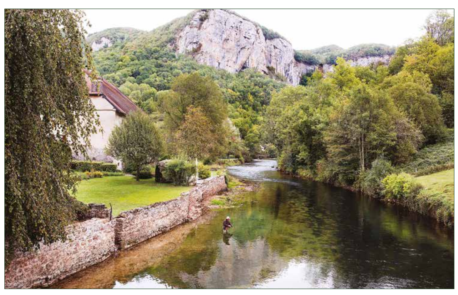
Fishing the French Loue in Montrond le Château near Beançon, Franche Comté. This incredible lot (no. 57) includes accommodation, food and local transport in the company of Gérard Piquard.

Some exciting and rarely available fishing opportunities in England, Scotland, Wales, Ireland, France, Belgium and Norway. A variety of flies, fishing tackle, shooting, art, literature and experiences. Also, fixed-price trips to Spain, Iceland, Chile and Argentina.