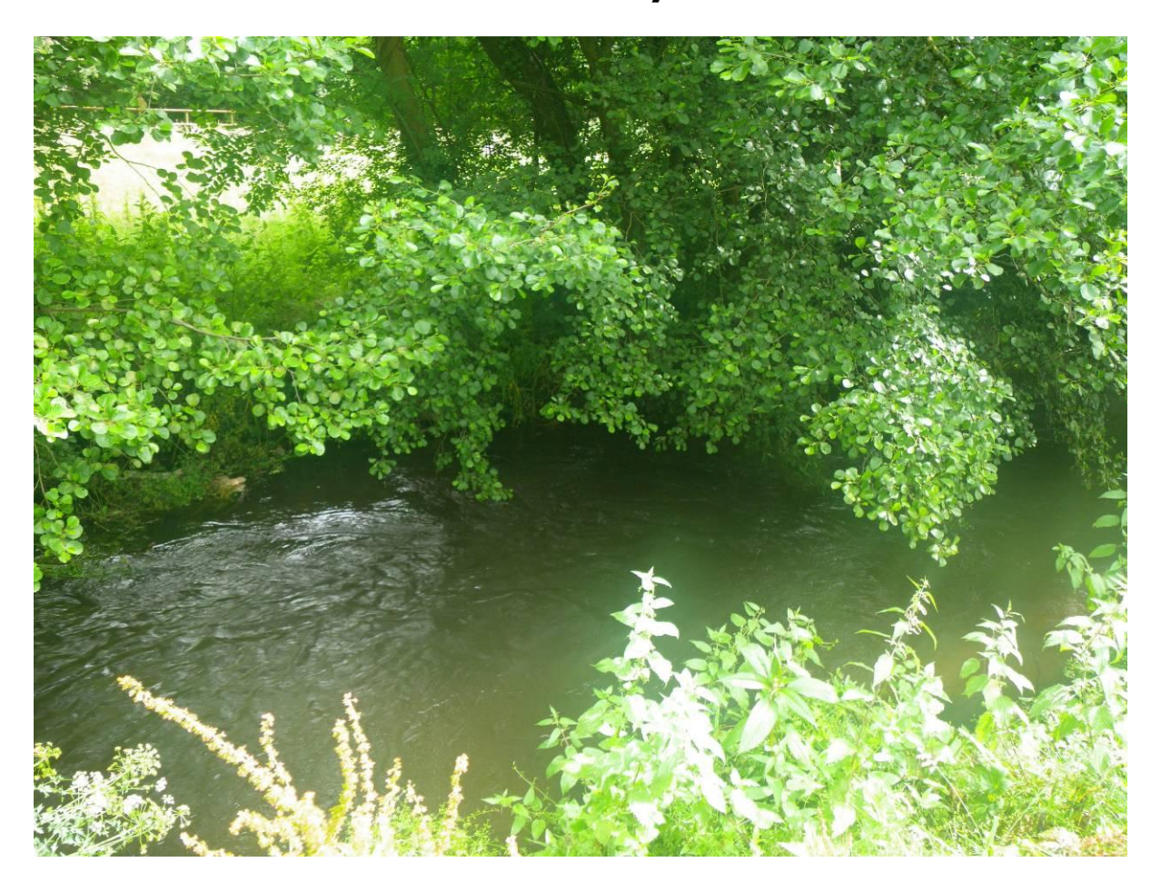
An advisory visit carried out by the Wild Trout Trust - July 2012