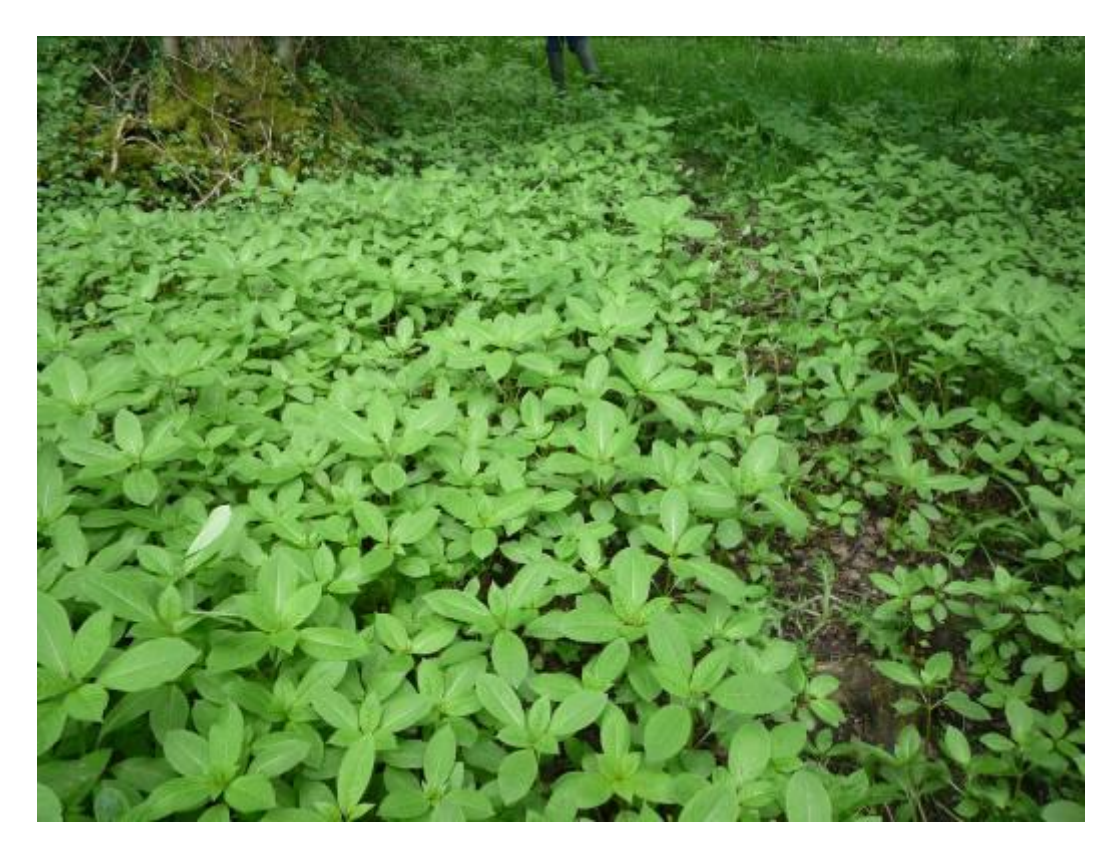
Himalayan Balsam can rapidily shade out other native plants leaving banks vulnerable to winter erosion.