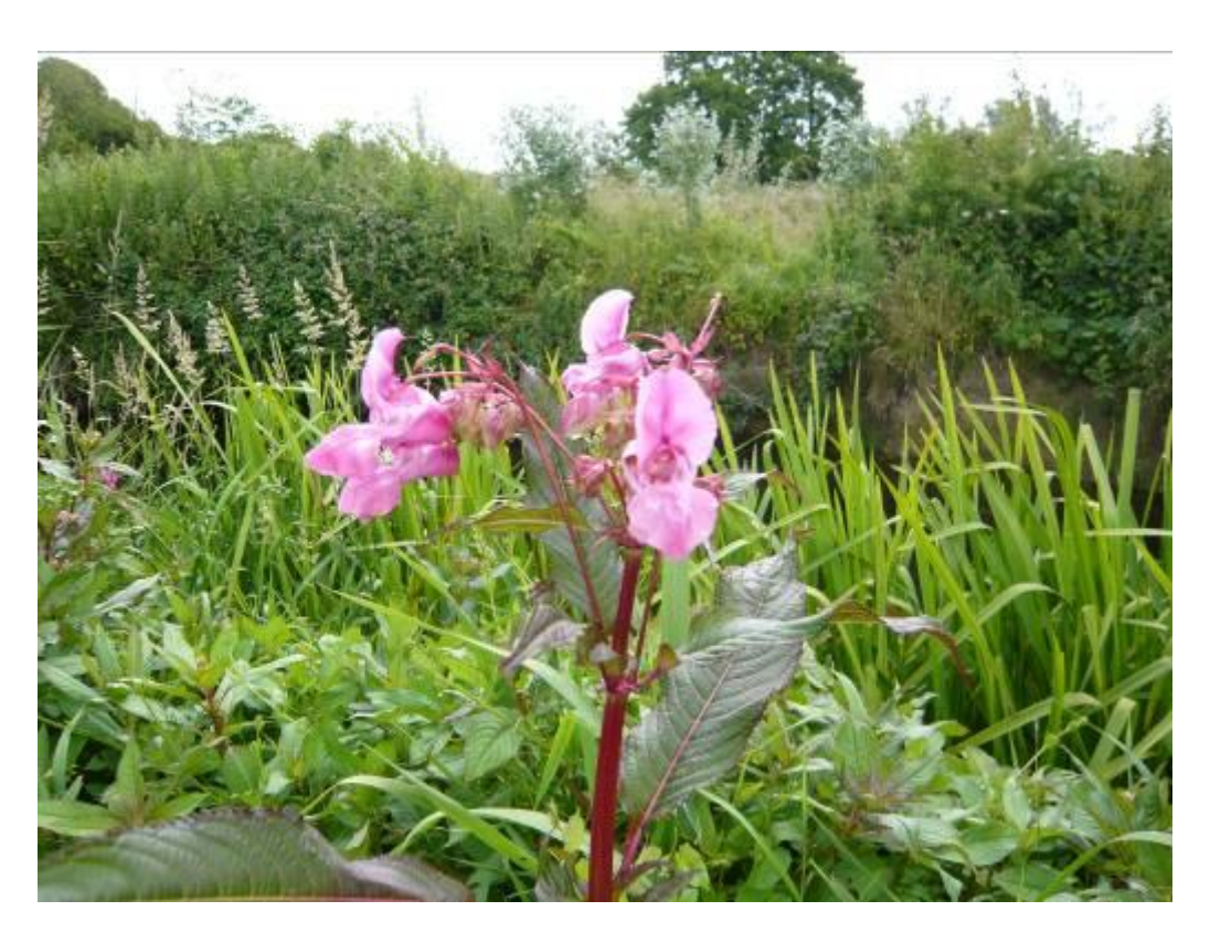
Himalan balsam flower. Easy to hand pull prior to setting seed pods.

It may take a couple of seasons to obtain good control due to the germination of more weed seedlings.