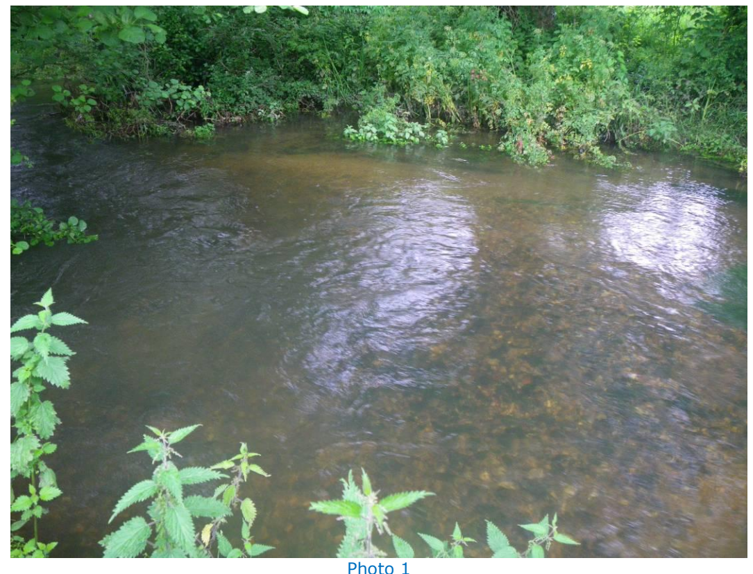
A site suitable for spawning – an area of gravel just downstream of a pool.

Trout spawn on shallow gravel glide areas where a good flow of water will flow through the nest or redd to keep the eggs well oxygenated and viable. If too much fine sediment infiltrates the redd during incubation then significant reductions in the conversion of eggs to fry can be expected. These gravel areas will often be on the downstream edge of pools, where river bed gravels have been blown out of a pool, usually due to a fallen tree or natural pinch point in the channel width. The Funtley Farm reach has some good areas of clean gravels which will provide good spawning sites for both resident brown trout and sea trout. See Photo 1.