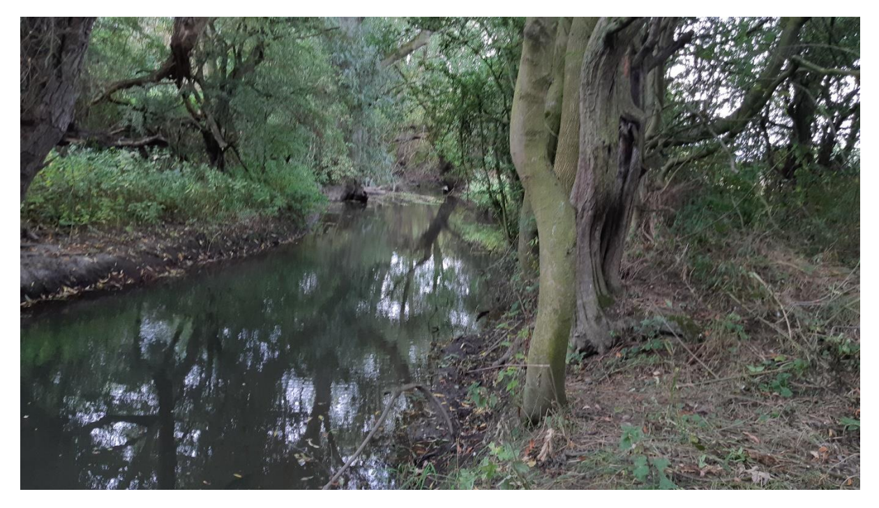
Figure 14: A section where, if sufficient gradient is available, bed-raising may create a more diverse riffle/pool sequence. It is worth investigating potential for removing any downstream structures that may be impounding water in this reach.