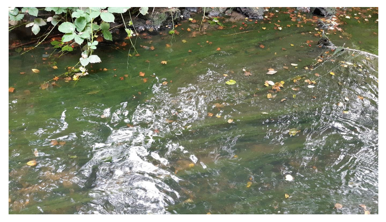
Figure 6: Sand and silk weed choked riverbed – indicating degraded habitat and poor water quality.