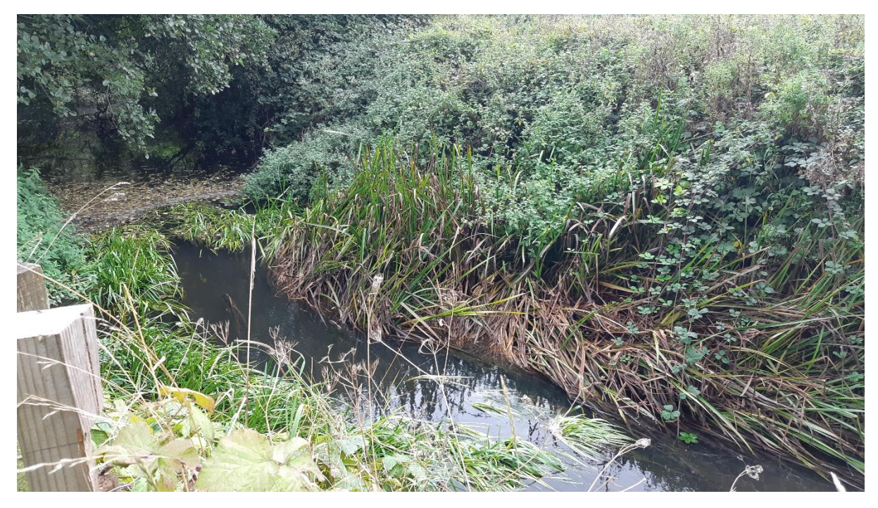
Figure 2: Fine sediment and ponded flows favour extensive ingression of emergent plants in this section of the Doe Lea.

As well as surface runoff from the carriageway of the A632, there are likely to be significant sediment inputs from the surrounding agricultural land (e.g Fig.3).