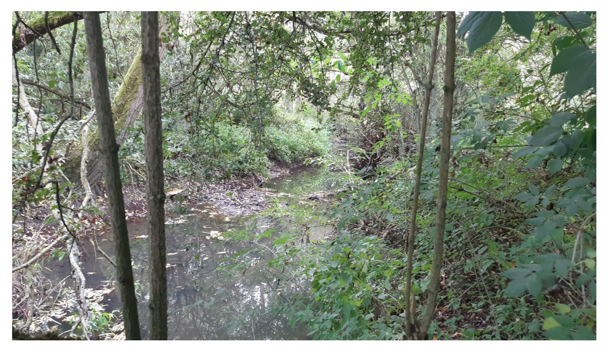
Figure 15: A plentiful supply of large woody material would help stabilise imported substrate in structurally diverse habitat features.

Figure 14: A section where, if sufficient gradient is available, bed-raising may create a more diverse riffle/pool sequence. It is worth investigating potential for removing any downstream structures that may be impounding water in this reach.