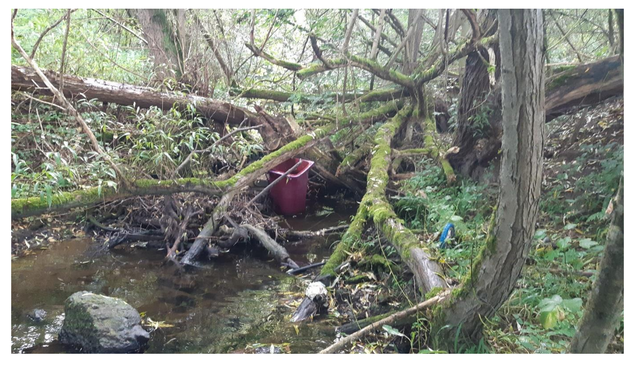
Figure 20: Woody debris – mixed with bins, bike and plastic debris. In spite of the size of this structure, multiple flow paths through and beneath the lodged material are present and it is not expected to pose a flood risk to surrounding land.

Just upstream of this weir a significant accumulation of woody debris had formed (Fig. 20). However, the conveyance capacity of the channel doesn't seem to be restricted below the hydraulic limit already set by the A617 culverting at 53.194444, -1.3150000 (Fig.21).