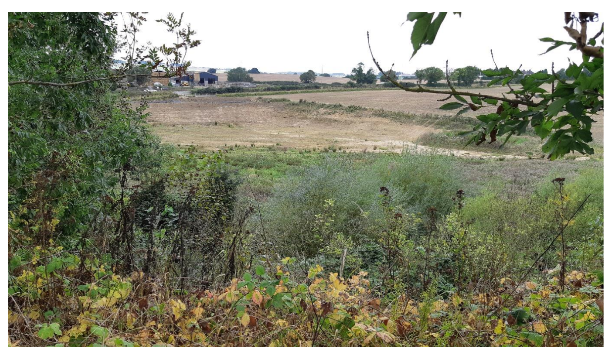
Figure 3: Looking down on the valley bottom from a vantage point above the RB shows the potential for sediment runoff to enter the Doe Lea – particularly from the LB around the downstream limit of this visit.

As well as surface runoff from the carriageway of the A632, there are likely to be significant sediment inputs from the surrounding agricultural land (e.g Fig.3).