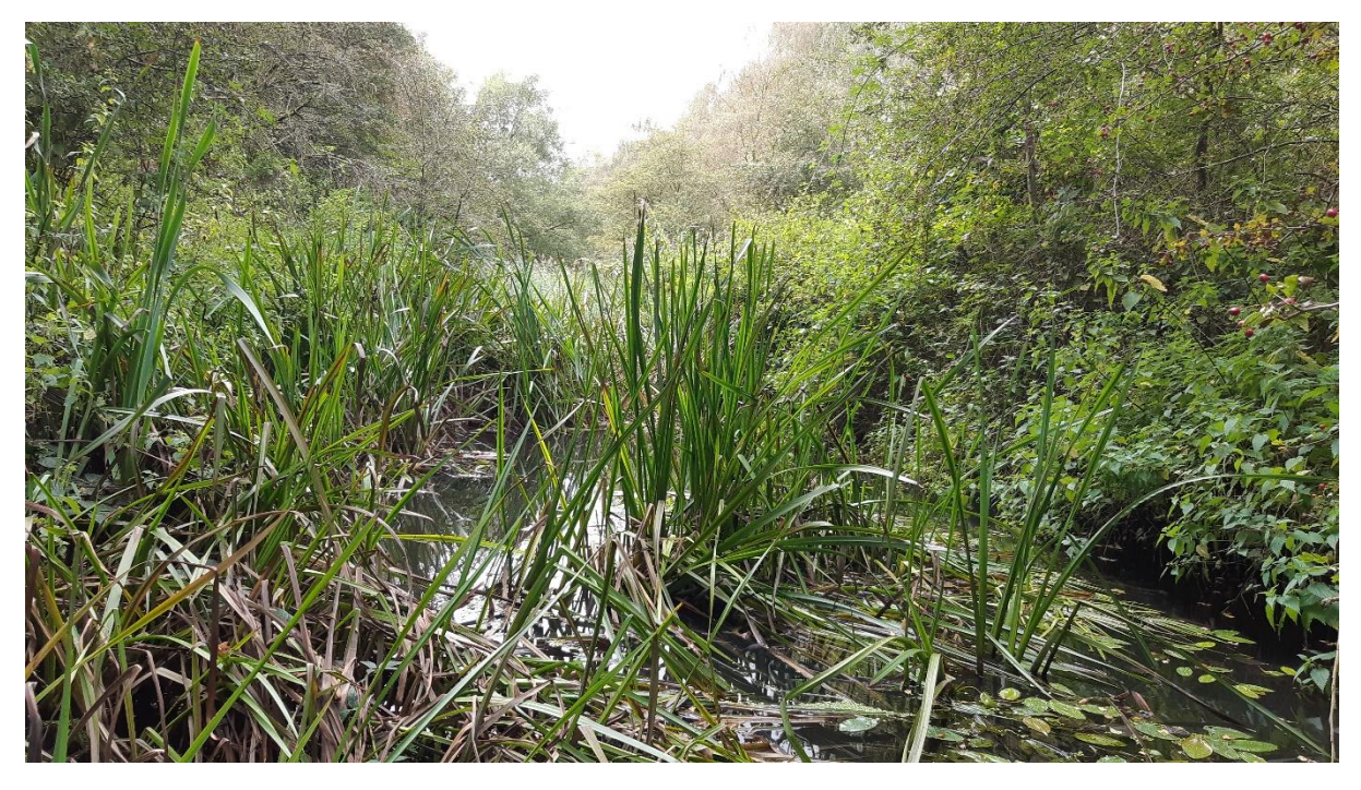
Figure 11: Emergent vegetation dominates the channel in the slowest flowing areas.

Figure 10: Under normal discharge levels, water is almost static in many reaches observed in Section 1 of the Doe Lea considered in this report.