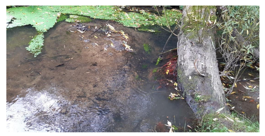
Figure 13: Though dominated by sandy substrate, the pinched flow caused by the tree has created some diversity in flow depth and velocity.

It may be possible to achieve a degree of habitat diversification in some locations by raising bed levels with imported cobble and gravel substrate. This would require topographical surveys to determine whether sufficient longitudinal gradient is available at specific locations. Without the gradient (coupled with reducing cross-sectional channel area) to support silt-dispersing flows at normal discharge levels, imported substrate would quickly become blanketed with fine sediment. However, indications that this may be possible were noted adjacent to Carr Vale Nature Reserve (e.g. Figs. 13-15).