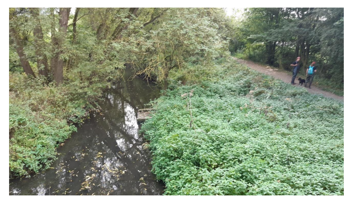
Figure 12: Further example of an extensively straightened, incised channel with ponded flow.

A major obstacle to improving the habitat is the land-use that was enabled by realigning the channel. Returning the channel to a more natural, meandering planform through the land won by altering the course of the river is not feasible currently.