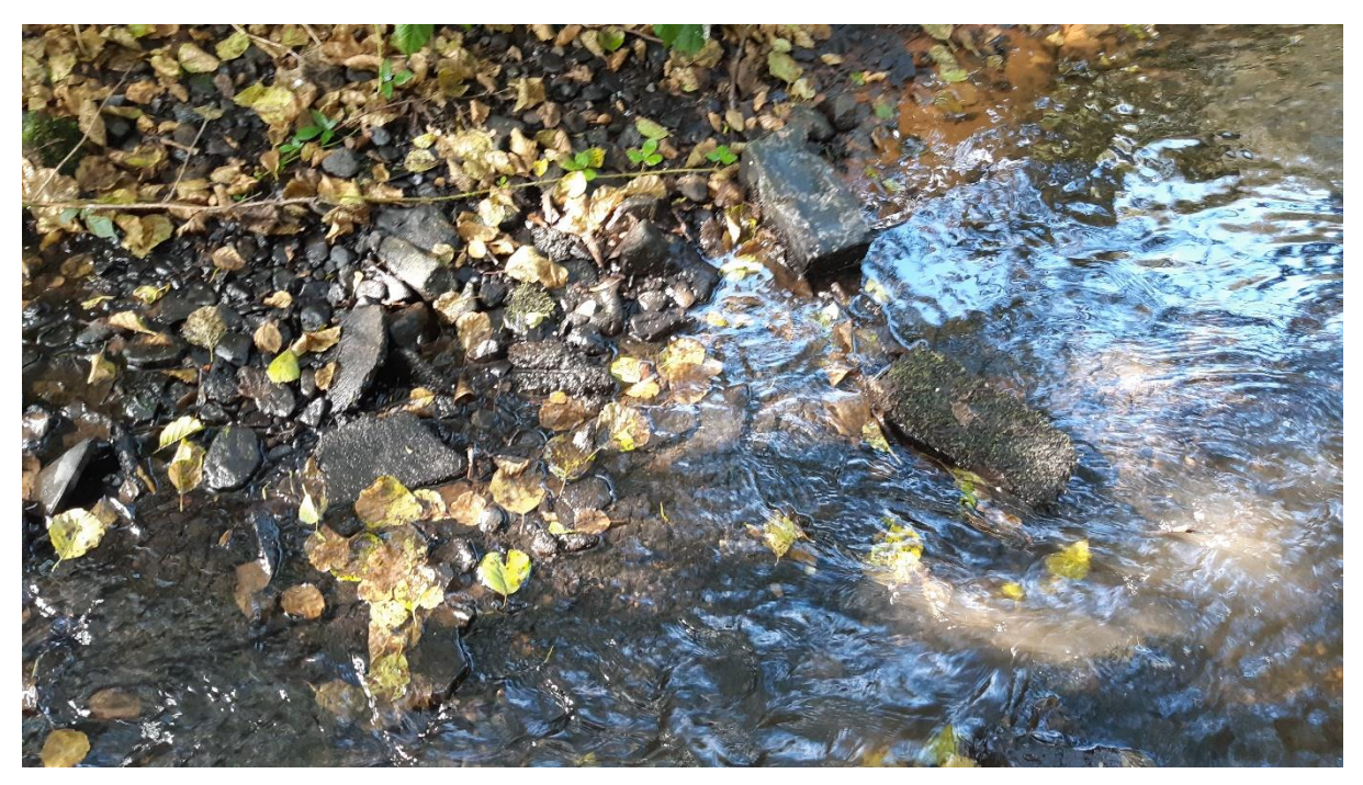
Figure 18: Gravel sized shale deposits - along with ochreous discharge and eroded brickwork.

bed. However, it is important to recognise that this section of channel is also likely to have been significantly straightened and revetted in the past.