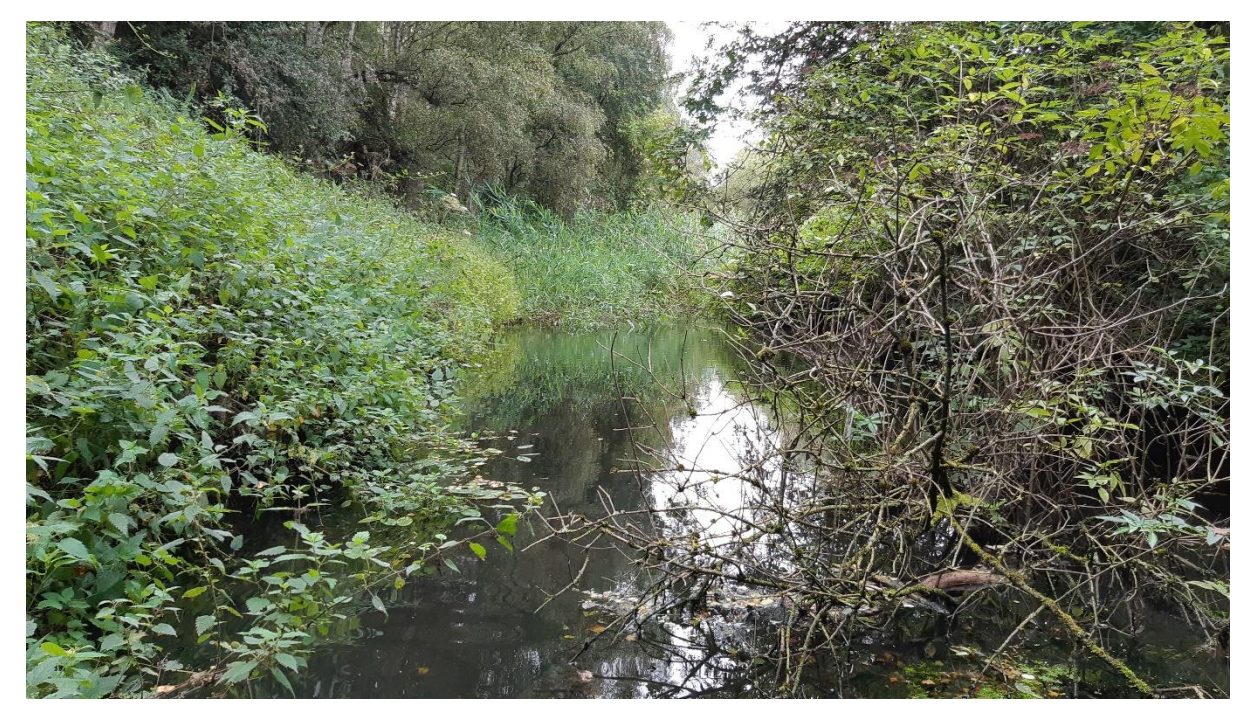
Figure 10: Under normal discharge levels, water is almost static in many reaches observed in Section 1 of the Doe Lea considered in this report.

Restoration of diverse habitat is constrained by the extent of previous channel modifications. Through an apparent combination of increased cross-sectional area of the channel and realignment, to create reduced longitudinal gradient, flow velocities are much reduced. The habitat within the channel commonly resembles a linear pond (e.g. Figs.10-12).