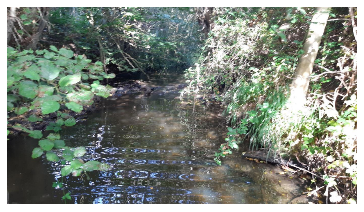
Figure 17: A scour pool approximately a meter deep under normal flow conditions was associated with a cobble and boulder feature formed from deposited material arising from scoured substrate.

Figure 16: Steeply incised but well vegetated banks. Note also the ochre (iron oxide) precipitation commonly associated with coal measures