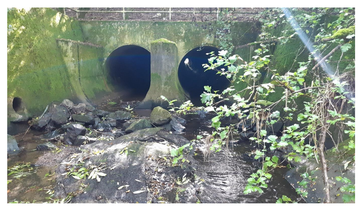
Figure 21: Twin pipe culvert running beneath the A617 at the top of Section 2 and setting the hydraulic limit for the downstream reach.

Figure 20: Woody debris – mixed with bins, bike and plastic debris. In spite of the size of this structure, multiple flow paths through and beneath the lodged material are present and it is not expected to pose a flood risk to surrounding land.