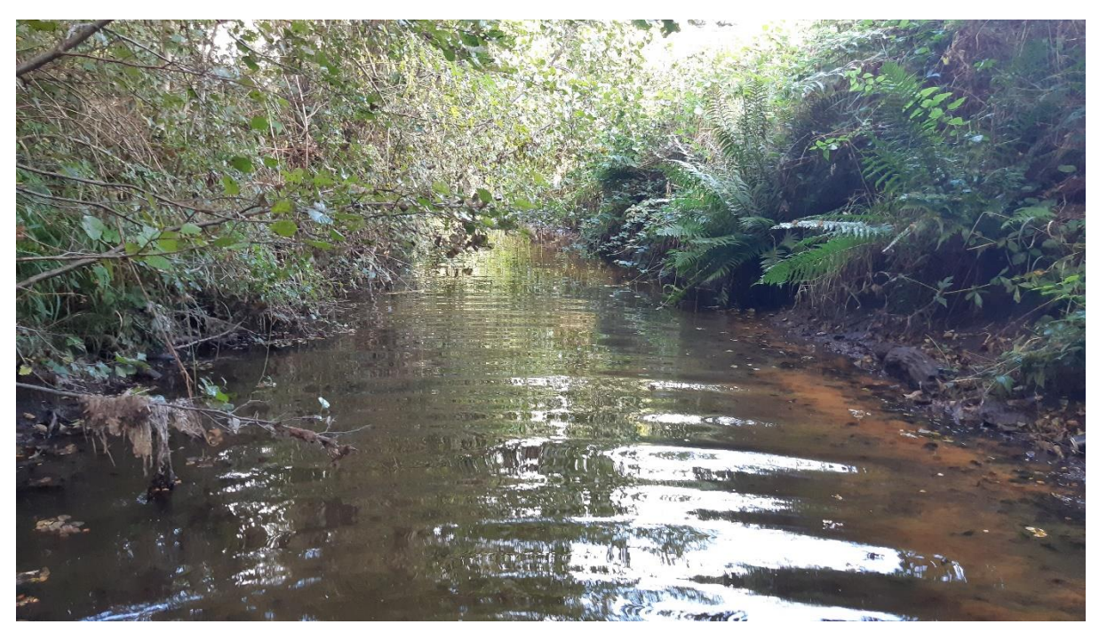
Figure 16: Steeply incised but well vegetated banks. Note also the ochre (iron oxide) precipitation commonly associated with coal measures

geomorphologically active channel was noted. For instance, the scour pool and cobble bar (Fig.17) observed a short distance up from the lower limit.