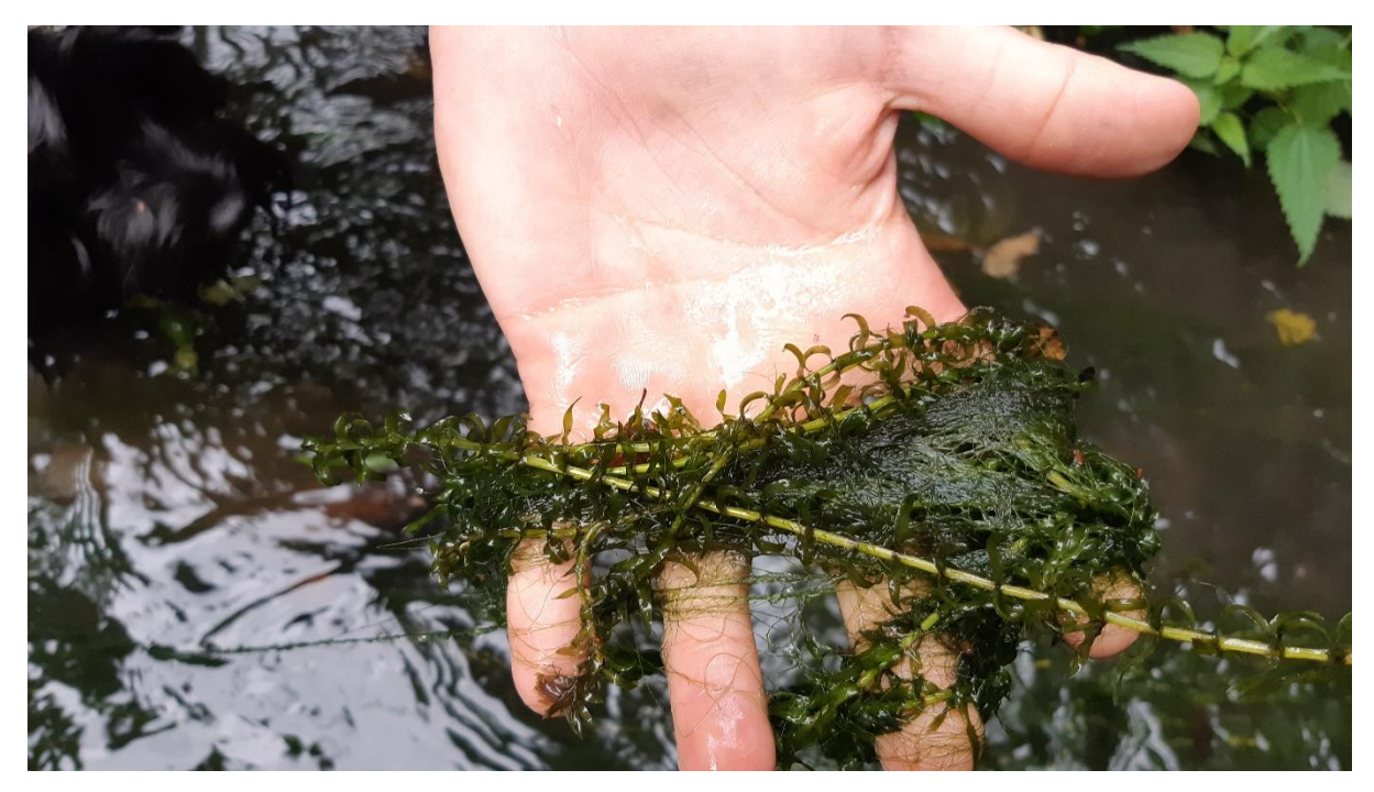
Figure 5: Extensive growth of filamentous algae and pond weed within the channel indicate significant nutrient enrichment (indicating a probable increase in biochemical oxygen demand and associated depression of dissolved oxygen levels).

The reach shown in Figs.1-4 has also, reportedly, been subject to petrochemical pollution from a nearby industrial source and is likely to suffer from nutrient enrichment from surrounding land-use (as well as sewage outfall inputs). Entering the channel in the area where the A632 crosses the Doe Lea revealed ecological consequences of both soluble and particulate pollution inputs (e.g. Figs.5-7).