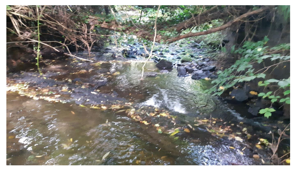
Figure 19: Low weir (foreground) and small bounder-sized substrate (background) which may have originated from engineered channel structures.

Further upstream, towards the A617, a low weir was noted which seemed to have been consolidated with slag or similar industrial by-product material. It was not simple to distinguish its construction from a natural shelf in the bedrock. Consequently, it is possible that some artificial construction had been added to an existing bedrock feature (Fig.19).