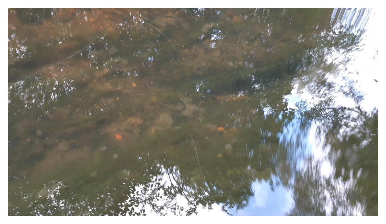
Figure 7: Sewage fungus is a colloquial name for the pale, gelatinous bacterial colonies visible (with difficulty) above the weed and sandy substrate here. These colonies thrive in response to excessive elevations in nutrient levels and strip the water of dissolved oxygen.

The channel is both straightened and rock-armoured in this reach – further limiting the potential for diverse habitat structures to arise (Fig.8). In rivers with a higher proportion of natural processes governing their formation, a much wider range of substrate particle sizes are found – along with a greater variation in cross-sectional depth and flow-velocity. That physical complexity provides far more opportunities for a diverse range of species to co-exist (whereas the Doe Lea lacks adequate structural variety).