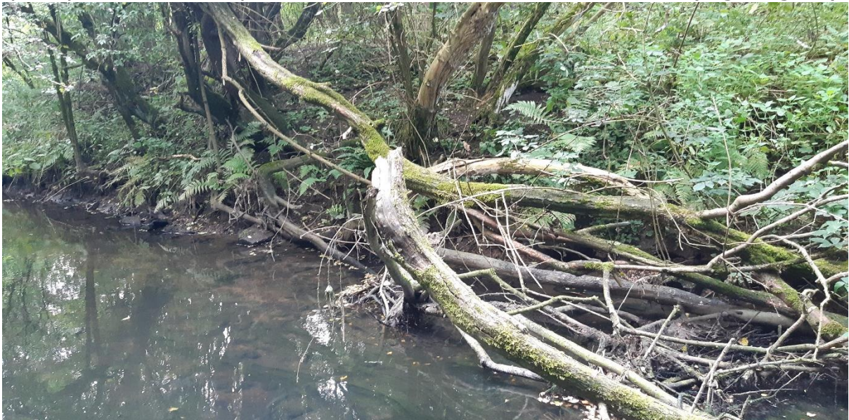
Figure 9: Natural dead-fall of riparian trees creates much-needed structural complexity in river channels.

Despite the multiple, compounding impacts on both habitat and water quality, some examples of valuable habitat were noted (e.g. Fig. 9).