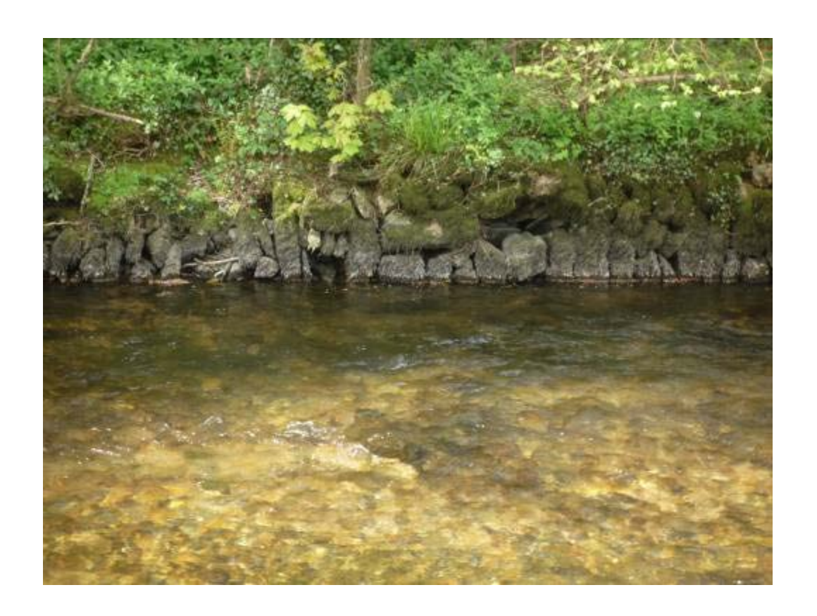
Large stones used to protect the RB from excessive erosion. Some low scrubby cover provided by a small goat willow would soften its appearance and enhance its fish holding capability