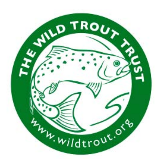
River Avon – Yeo Farm, Loddiswell