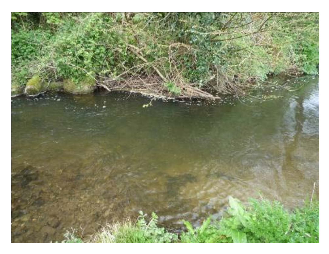
A good example of a small West country river where an old fallen tree has created a great pool.