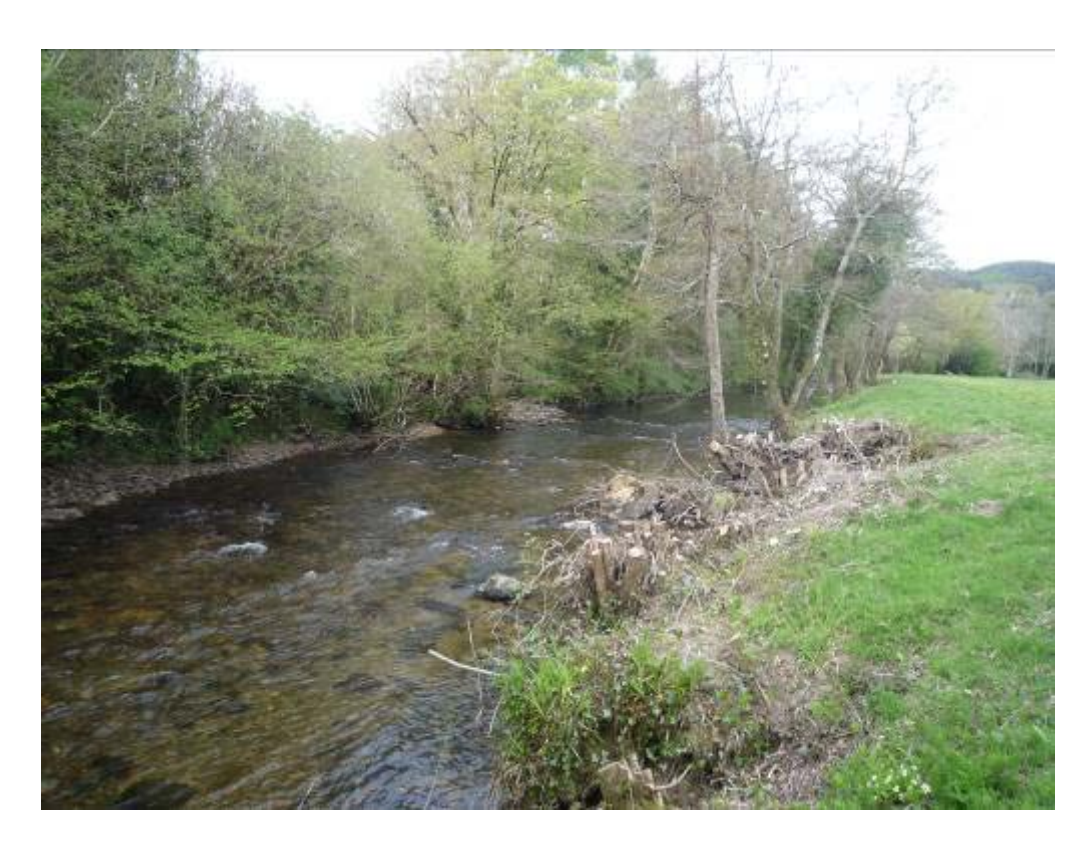
An area near the bottom of the beat where some coppicing has been carried out. It may be possible to "hinge" some trees into the channel to create secure flow deflectors on the heavily shaded upstream beat

Note: If the debris dam needs to be removed but there is still a significant amount of the root system attached to the bank then it is recommended that the stump be retained for its wildlife habitat value and its stabilising effect on the bank.