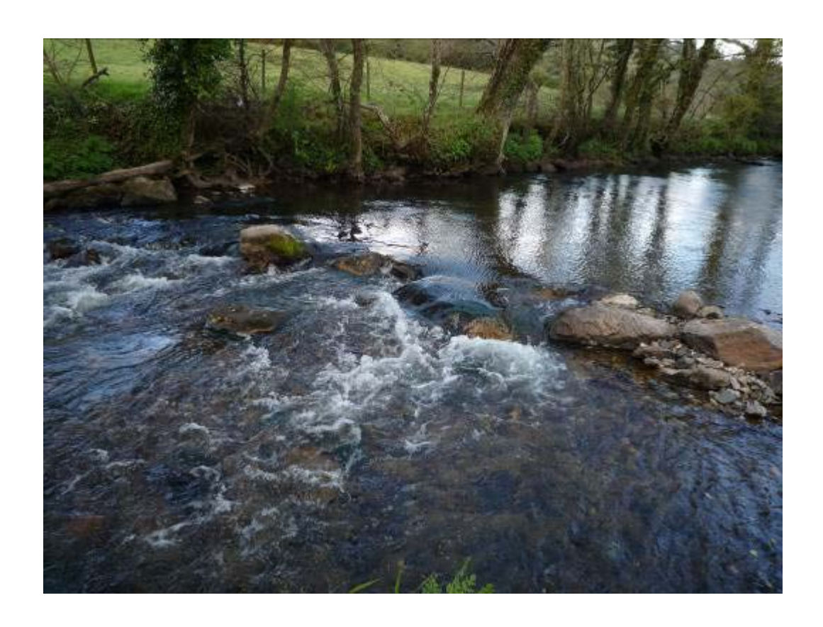
Large stones configured to create a weir and impound water. Not a barrier to fish migration but no great benefit in habitat quality

Better quality pool habitats are usually created by promoting downward river bed scour rather that holding the water back with any form of impoundment. Pools that form naturally are often kick started by a fallen tree where the flow hits the underside of the trunk and is forced downwards. Even after the tree has disappeared pools can remain very stable for many years. Raising the water level through impoundments can often result in sterile laminar flows upstream of the impoundment: much poorer habitat for adult salmonid fish than a naturally scoured pool. Promoting improved holding water with large fallen trees may well help to promote better quality pool habitats, particularly on the upper reaches of the beat. Where more than one tree has fallen into the channel it should be remembered that pool habitats rarely form too close to one another. As a general guiding principle, a decent pool will only form at a distance of approximately 5 to 7 multiplied by the average channel width. So if your average channel width is say 10m, then you would not generally expect a pool to develop within approximately 60m..