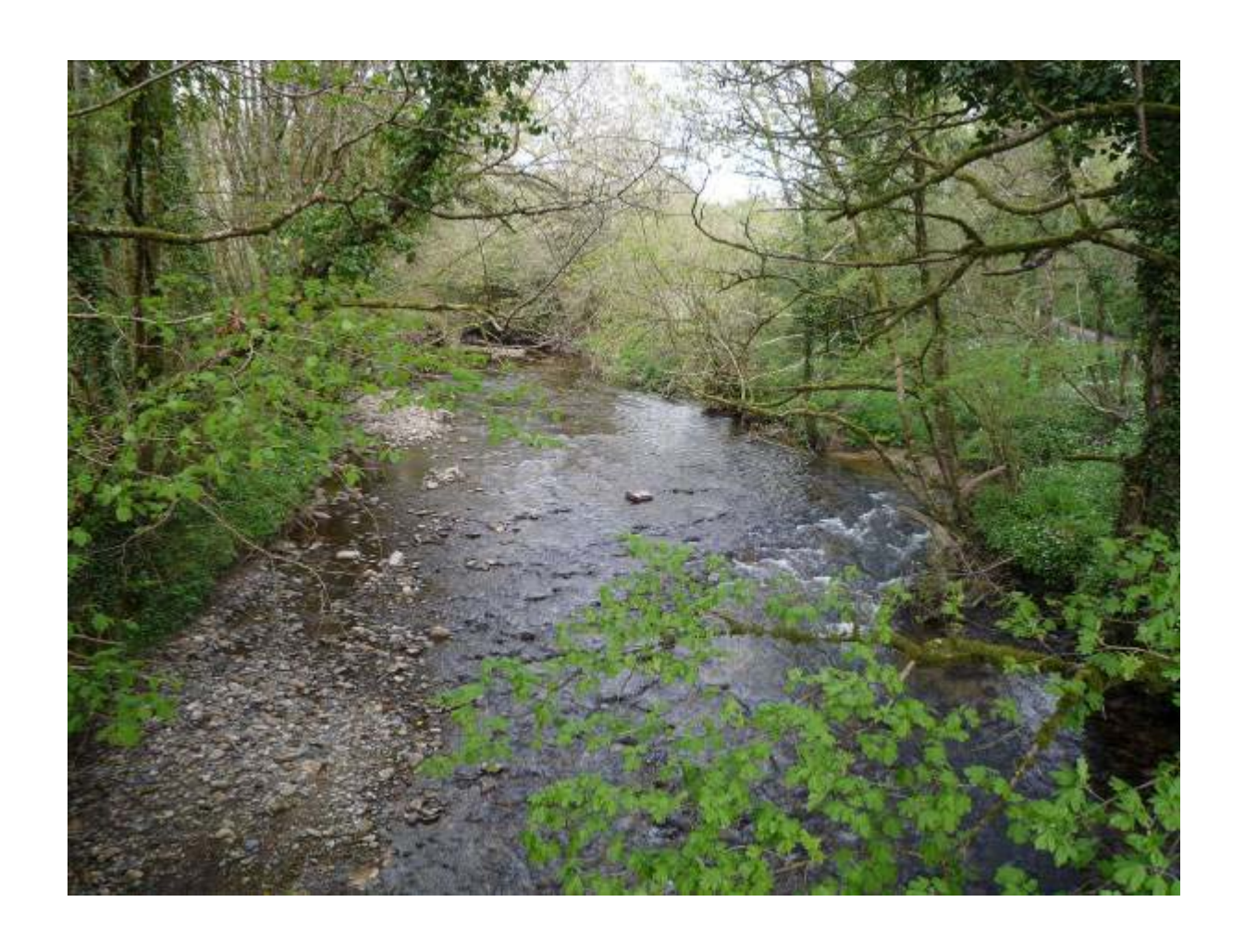
An advisory visit carried out by the Wild Trout Trust – April 2009