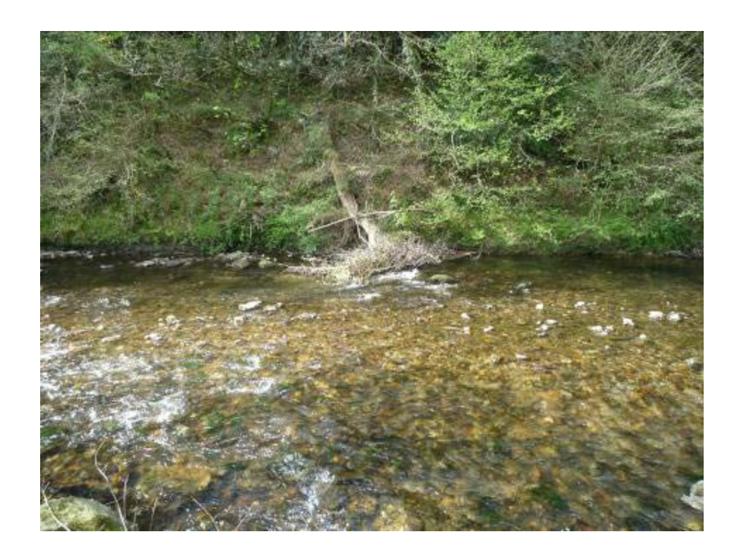
A good example of some LWD providing excellent marginal cover

Traditionally many land managers and riparian owners have treated LWD in streams as a nuisance and have removed it, often with uncertain consequences. This is often unnecessary and harmful: stream clearance can reduce the amount of organic material necessary to support the aquatic food web, remove vital instream habitats that fish will utilise for shelter and spawning and reduce the level of erosion resistance provided against high flows. In addition LWD improves the stream structure by enhancing the substrate and diverting the stream current in such a way that pools and spawning riffles are more likely to develop. A stream with a heterogeneous substrate and pools and riffles is ideal for benthic (bottom dwelling) organisms as well as for fish species like trout.