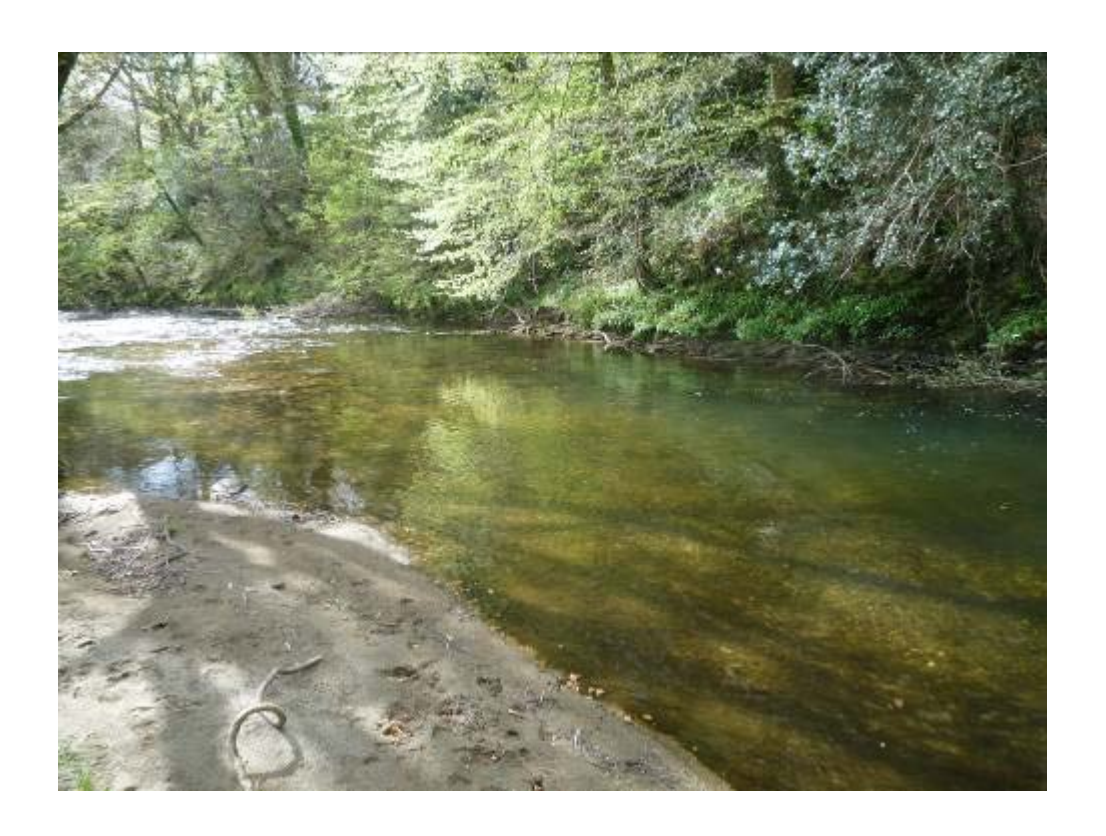
The tail of a superb naturally formed pool. A great lying up spot for sea trout and salmon. Some overhanging shade is an essential component of good quality pool habitat.