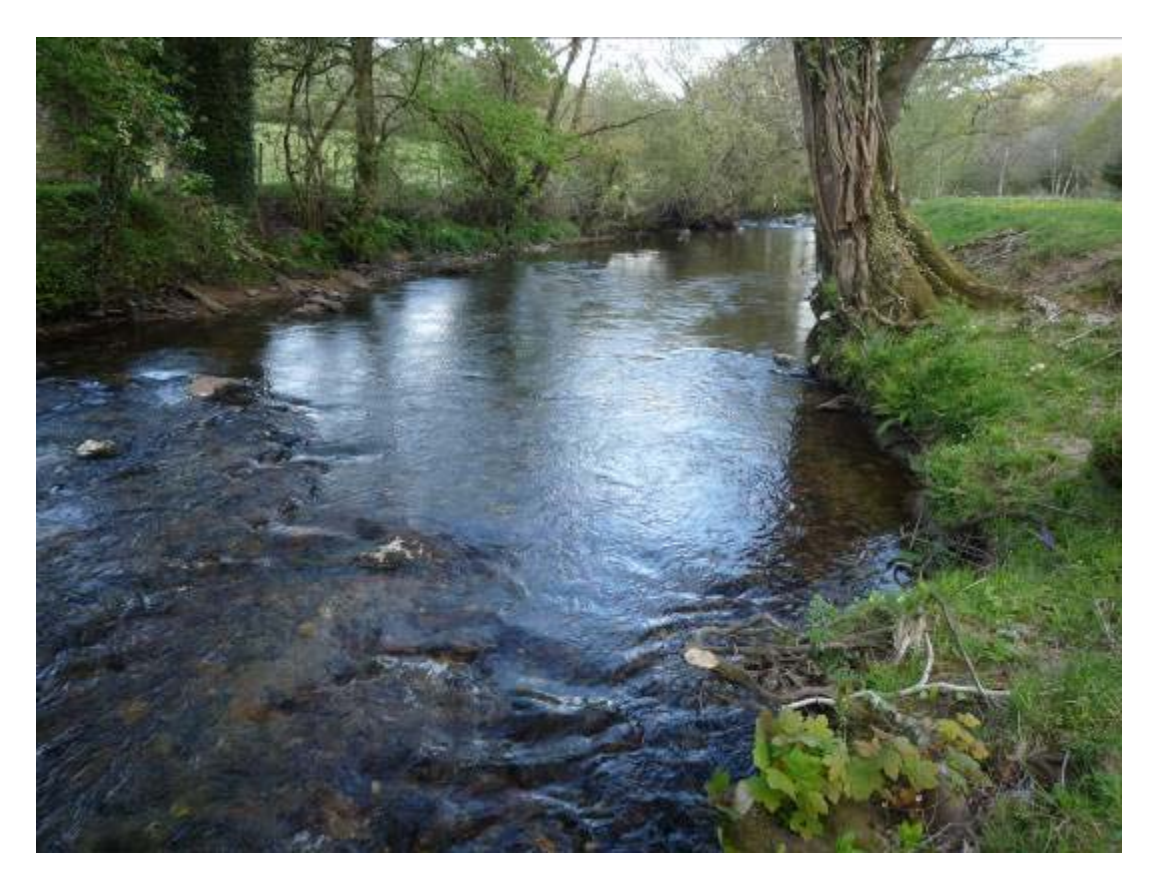
A large ivy clad tree where the ivy stems has been cut to protect the tree. Ivy clad trees are very important for summer roosting bats so some of this habitat should be retained throughout the reach

Care must be taken when carrying out any maintenance on the small side stream. LWD should be left within the channel and if necessary woody brashings placed over the shallow riffle areas to protect fry from predation. If debris dams form they should be regularly checked, particularly from October through to January to ensure that migrating adult fish can still make progress upstream. The banks and marginal zones should be left scruffy and do not tempted to tidy up the channel or strim the margins.