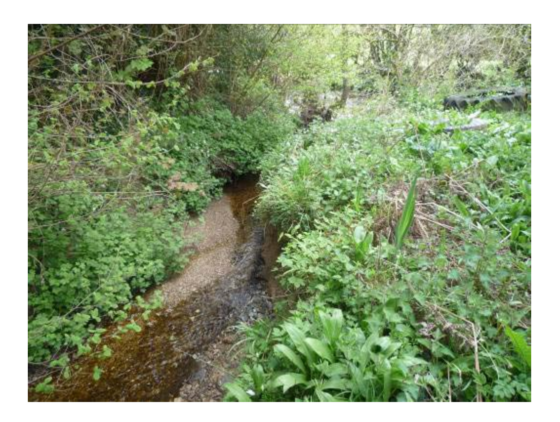
Small stream entering the river just above Topsham bridge. Potentially a critically important habitat for spawning and juvenile trout.

Near to the bottom boundary a small stream joins the main river on the LB. These small side streams are usually critically important spawning and nursery habitats on spate river systems and care should be taken to ensure that water and habitat quality is protected. These streams require good amounts of both LWD to help sort spawning gravels and CWD (Coarse Woody Debris) to provide overhead protection from predators. If debris dams build up they should not be removed unless they are considered to be a blockage to upstream migration. This is unusual as there are normally small undercuts and gaps where fish can find a way through.