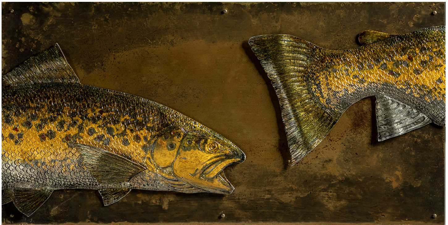
Lot 2, Chasing Gold by Sam Macdonald

One day for 1 rod fishing the Isle Beck system near Thirsk, North Yorkshire. A small overgrown stream with plenty of wild browns; you may also get grayling, chub, dace and some stocked browns. There is good fly life including Mayfly and the fish will respond to dries and nymphs but casting accuracy will be needed. A short rod (5ft to 6ft 6in preferred) and tall waders are essential on this challenging stream. A Club member will accompany you, act as ghillie and provide a packed lunch and drinks during your day. 2024 season.