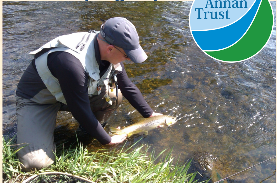
A 5lb summer brownie being returned in 2012

For several years now the River Annan has used anglers to get data on the health of the fish stocks in the winter fishery. Primarily this has been targeting the Grayling stock but of course other fish species have been caught. This has been a really useful project as we are now in a better position to understand the abundance and stock structure of the fishery.