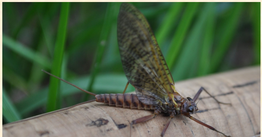
The iconic March Brown, this insect is important to anglers but is increasingly rare in the UK, information about sightings of this animal will be useful as the Annan is one of the few remaining strongholds.