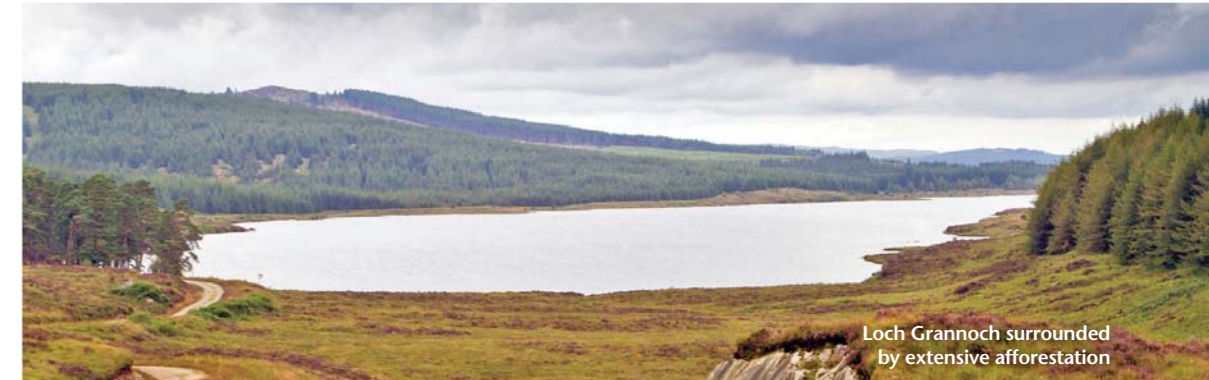
Loch Grannoch surrounded by extensive afforestation