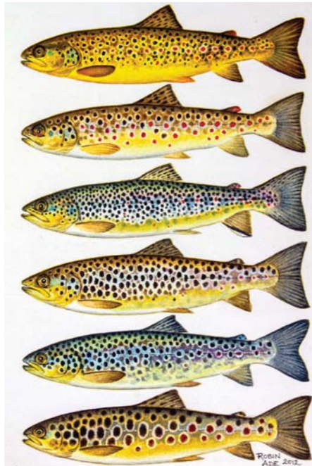
Figure 3. Some examples of colour variation in Galloway & Carrick trout

Loch Fleet was the focus for many studies on acidification from 1984-94, funded by the UK coal and electricity industries. In the first half of the 20th century, Loch Fleet contained a thriving stock of trout but catches declined markedly after 1950 and no fish were caught after 1975. Diatom records indicated that acidification started c1960 with the pH dropping from 6.6 in 1961 to 4.3 in 1975. During 1984-86, gill-netting, trapping and electrofishing confirmed trout were absent from the loch, its inflowing streams, and the outlet river for a distance of 7km downstream. Trout were present below this point, where the geology resulted in higher pH, but were prevented from passing upstream by a 5m waterfall. Experiments showed that brown trout eggs and fry could not survive in the loch water as a result of low pH, low calcium and high aluminium concentration. The land surrounding the loch was limed in 1986 and 1987 improving conditions and raising pH close to 7.0. Trout were stocked into the loch in 1987 and 1988 from three sources: below the outlet waterfall; Loch Dee; and a long established Leven-based farm strain. From 1988 to 1993 egg survival was monitored