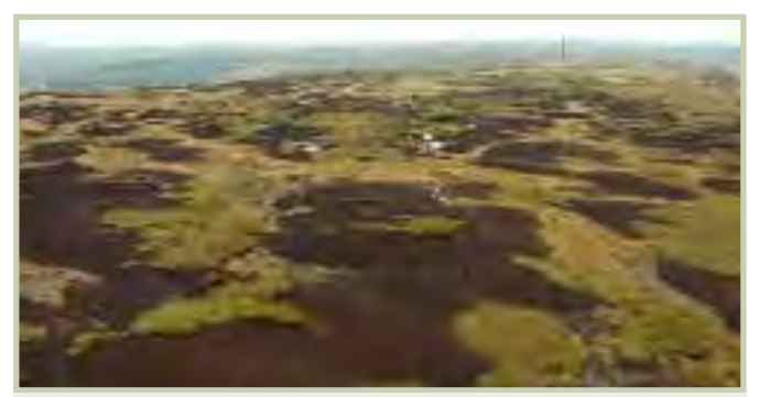
SERIOUS MOORLAND EROSION ON BLACK HILL, PEAK DISTRICT

Upland river processes are dominated by the geology, climate and land use within the catchment. These physical factors and their impact on upland rivers, particularly their linkage to instream ecology and key lifestages of trout, are examined in detail.