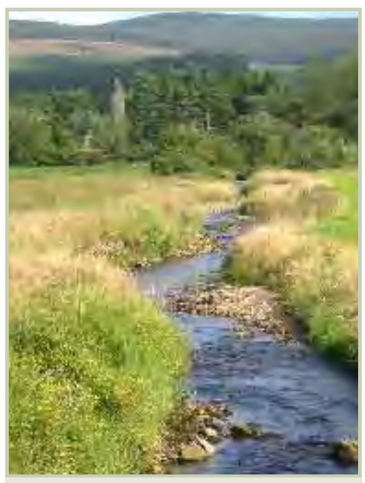
UPLAND SPAWNING STREAM AND ITS IMMEDIATE CATCHMENT

Each section of the manual can be accessed via the hyperlinks on the upland river diagram (1.5 of this Section). Double clicking on these links will take you straight to the appropriate section. Links are also provided to useful sections of the WTT Survival Guide and the WTT Chalkstream Habitat Manual.