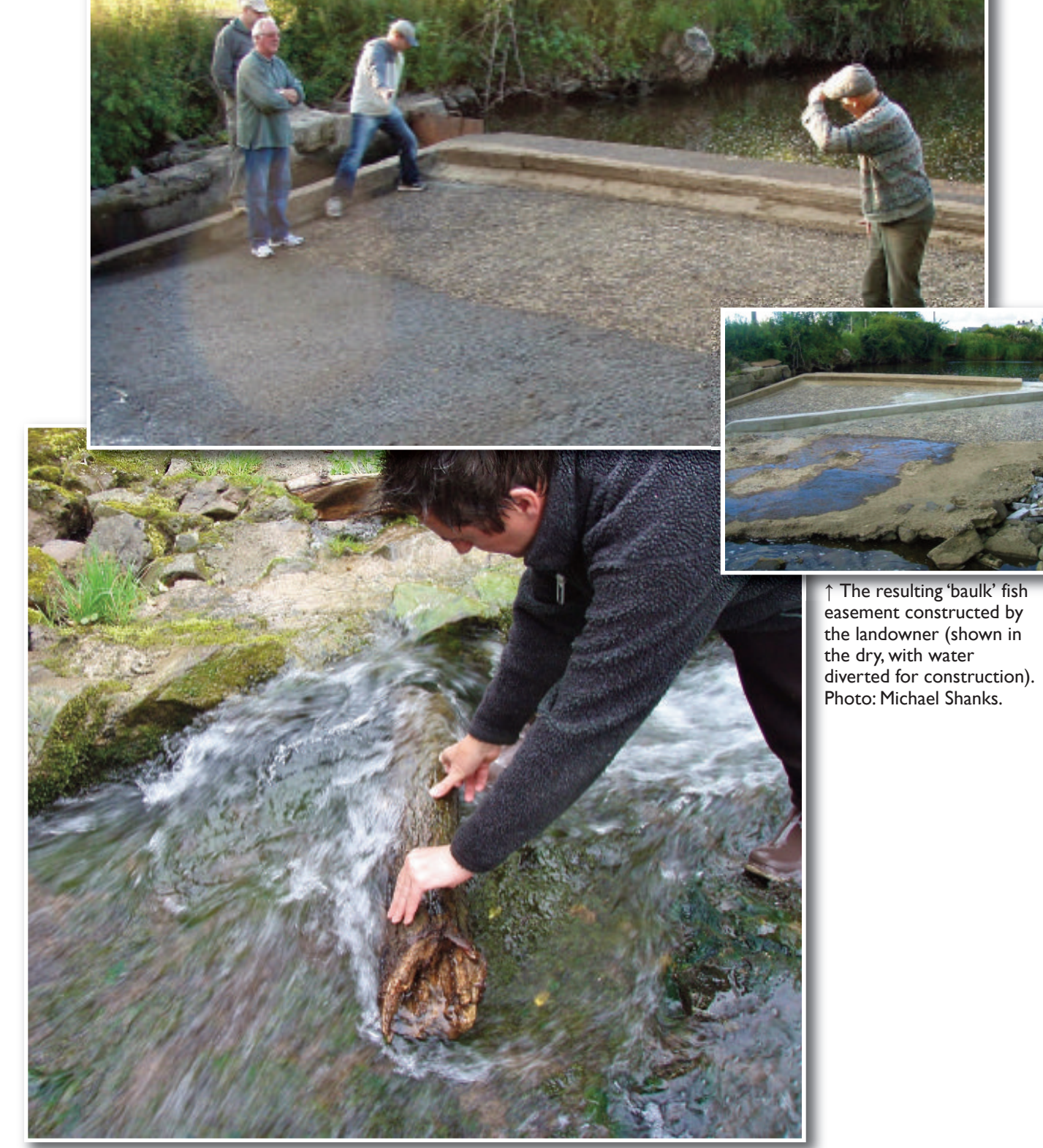
↑ Experimenting with where to place baffles for easing fish passage at a weir on the Potto Beck, River Leven, North Yorkshire.

\downarrow Discussing fish pass options with a landowner on the River Lagan, Co. Down.