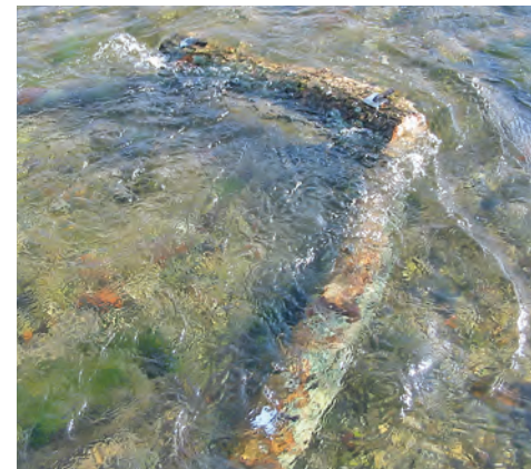
Upstream facing ‘V’ deflector

LWD can be added by using a tear cut in bankside trees, and hinging the timber into the river where it can be fixed using rebar driven into the bed through pre-drilled holes in the timber, or by fixing the trunk with wire to wooden posts driven into the bed. Where it is not possible to use hinged timber, cut trunks and large branches can be used in the same manner. Care should be taken to key them into the bank, to minimise erosion. For the same reason, LWD should normally be fixed facing upstream in the channel. Where possible, leave as many of the smaller branches as possible on the trunk. LWD can also be used to create deflectors in mid-channel. Paired sections of LWD can be fixed to the bed in an upstream ‘V’ shape, resulting in the creation of a pool and short length of well-sorted gravel suitable for spawning trout.