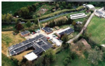
FBA facilities in Cumbria & Dorset

For membership information and general enquiries please contact: