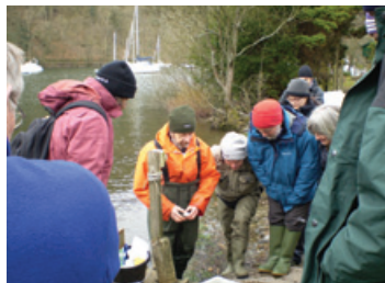
Course participants identifying invertebrates

For further information or to book a course please contact events@fba.org.uk