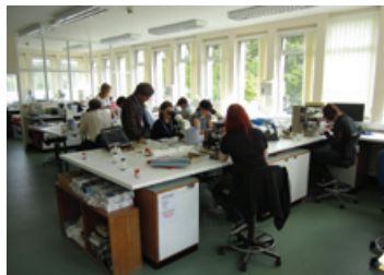
FBA laboratory at Windermere, Cumbria